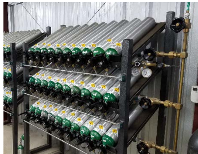
Rack Modular Connectivity with Header and 3, row Isolation and a 4 th valve for rack Isolation