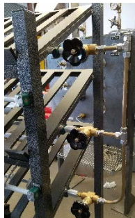
R30 Side Header with 3, row Isolation