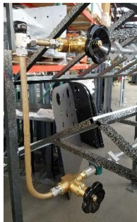
R20 Side Header with 2, row Isolation