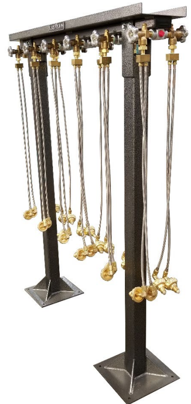
Left: Shows the modular connection with dual pigtail station valves with tee and CGA fittings